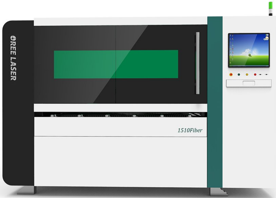
SMART FIBER LASER CUTTING MACHINE OR-S