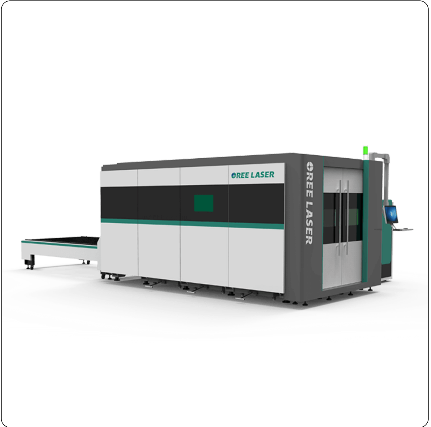
ALL COVERED FLATABLE FIBER LASER CUTTING MACHINE OR-P