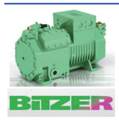
Germany Bizter compressor (standard)