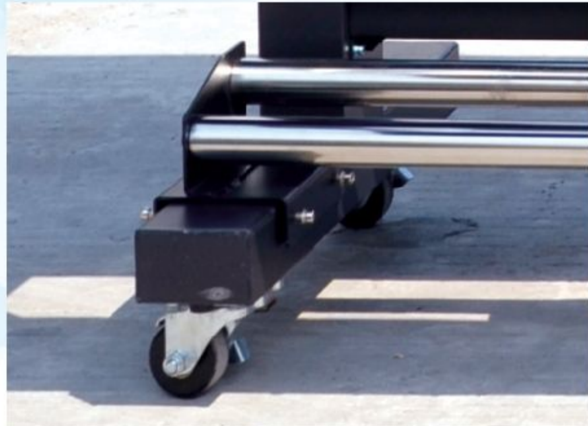
Perfect Media Feed & Roll System