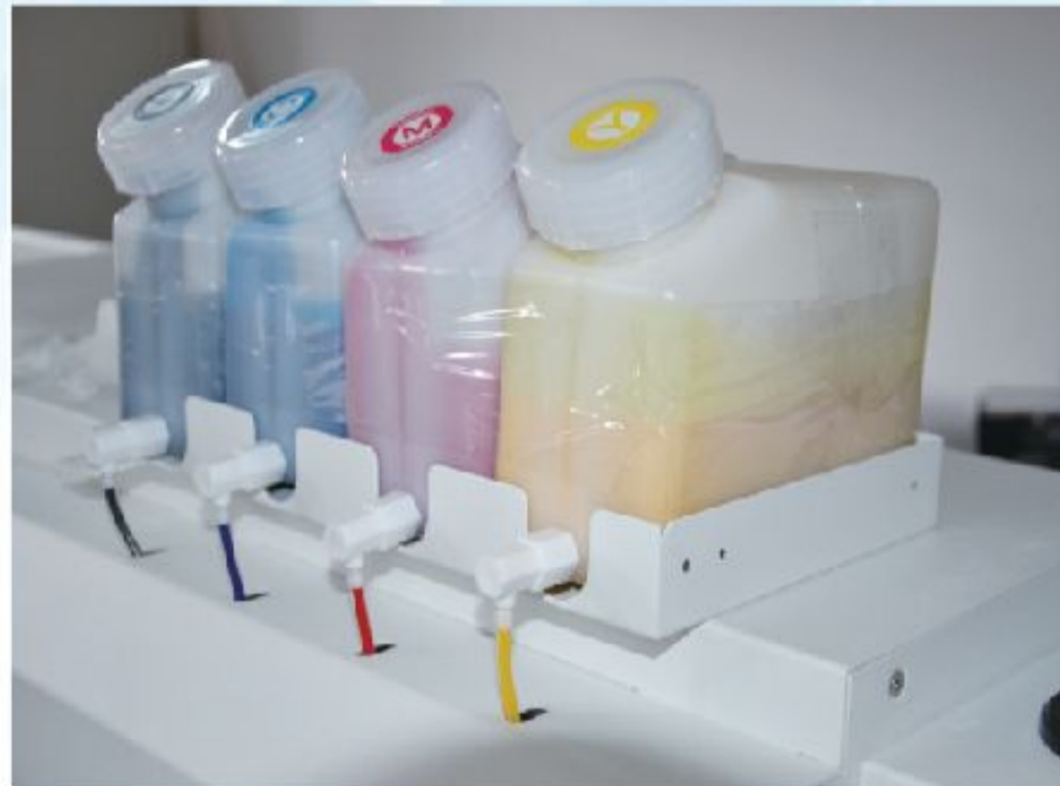
Stable Bulk System Ensures Amazing Printing Speed