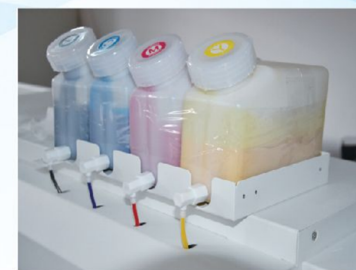
Stable Bulk System Ensures Amazing Printing Speed