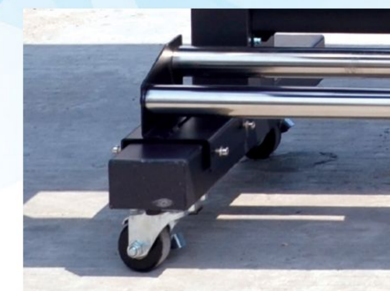
Perfect Media Feed & Roll System